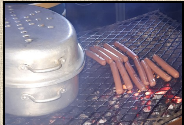
For those preferring Hot Dogs