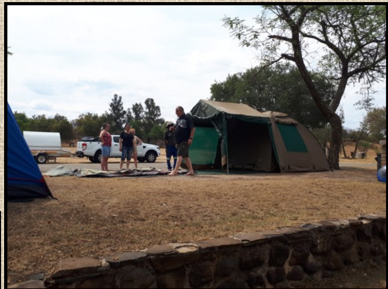
Photo Right: The Doran family pitching their two tents & a Gazebo.