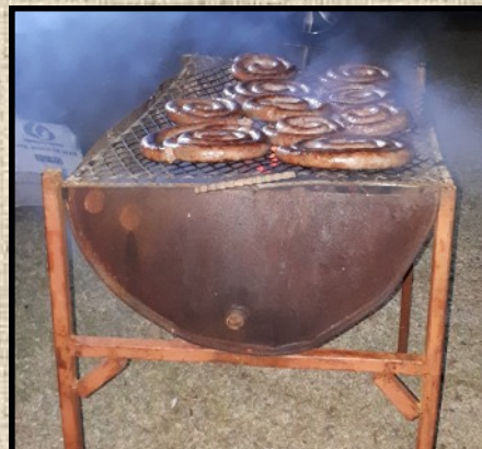
Wors under Gert's Supervision