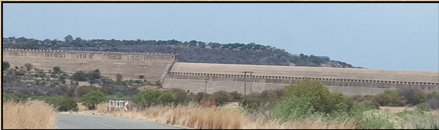
Going towards the Aldam Holiday Resort one rides parallel to the Dam wall.

The long awaited Friday 30 Oct had dawned and the main group of the Chapter met up and left at 10h00 from the Checkers Parking Area in Carletonville for Aldam Holiday Resort in the Free State. This being the 3rd Chapter Year End Breakaway Weekend since its inauguration on the 14 November 2017. Even Covid-19 Lock-down level 1 didn't cause a reduction in the number of members who attended this year. In fact the Members & Family numbered 36 souls for this year making it the Chapter's Best Year End Ever.