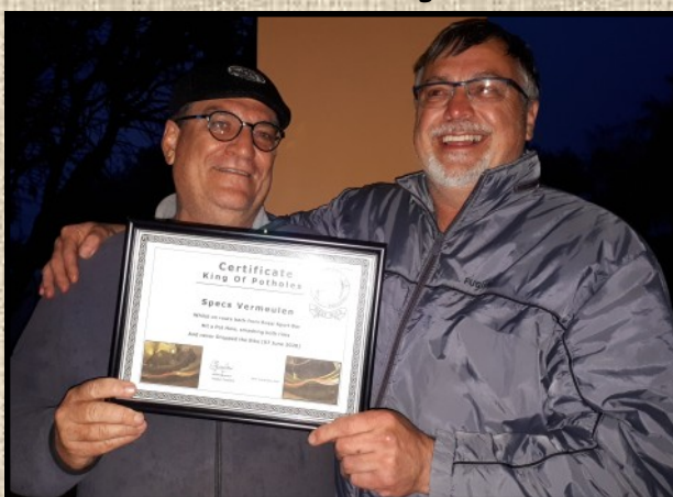
Specs [Snr Road Capt]- King of Pot Holes Hit a Pot Hole at High Speed, smashing both rims And never Dropped the Bike