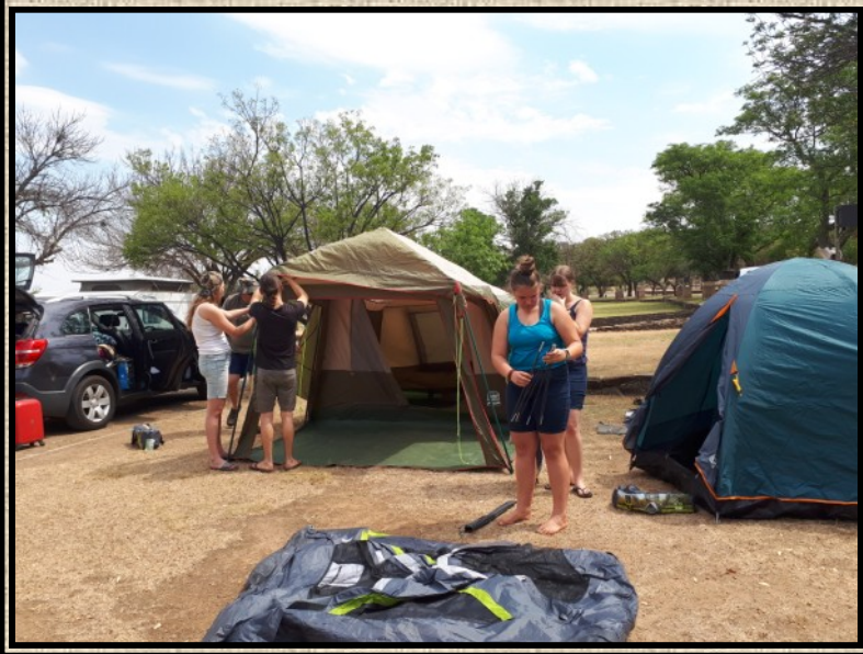
Photo Left: The Nagel family helping to pitch their 3 tents & gazebo.