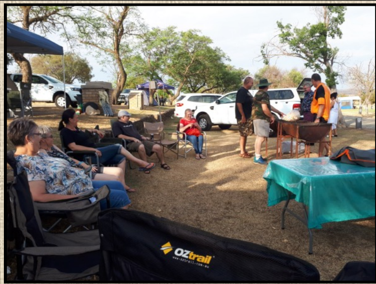
Friday evening getting braais started .

"borrowed" whilst those in the know duly braaied the wors & Vienna's .